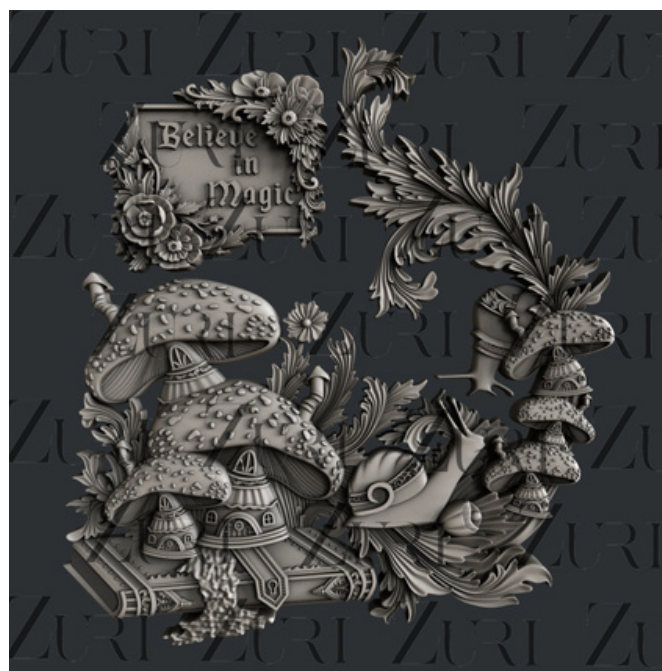
BELIEVE IN MAGIC

Our fairies will be making a splash in early April of this year. We can hardly wait!